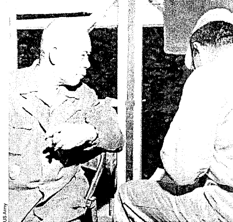
General Yamashita shortly after his 2 September 1945 surrender to U.S. forces in northern Luzon.

General Tomoyuki Yamashita was charged with unlawful disregard of and failure to discharge his duty as commander to control the members of his command from committing brutal atrocities in the Philippines against civilians and prisoners of war. . . . Because his trial was held under U.S. auspices in the Philippines, a U.S. territory until 1946, Yamashita was able to appeal to the U.S. Supreme Court, arguing that the military commission lacked jurisdiction to try him. The Supreme Court disagreed.