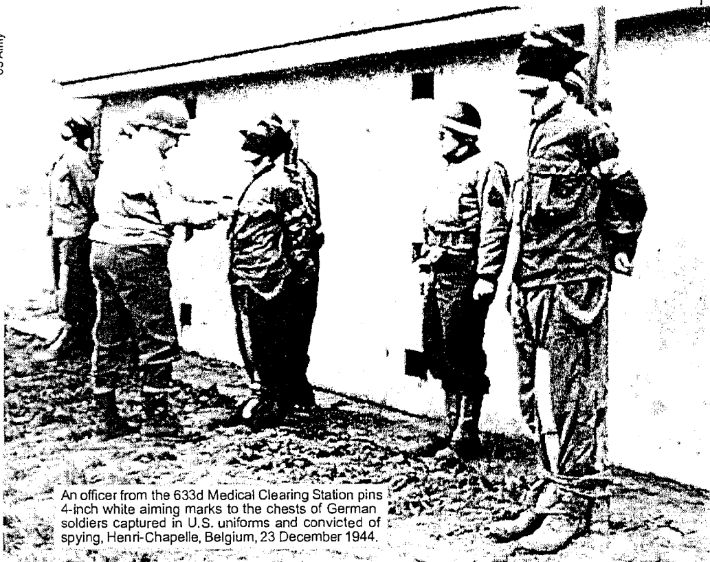
An officer from the 633d Medical Clearing Station pins 4-inch white aiming marks to the chests of German soldiers captured in U.S. uniforms and convicted of spying, Henri-Chapelle, Belgium, 23 December 1944.

Between October 1944 and May 1945, military commissions tried approximately 67 individuals, and at least 32 were executed. Among these were 18 German soldiers captured while wearing U.S. uniforms behind U.S. lines during the Battle of the Bulge. They were convicted of spying and executed. In the period between the end of the fighting in Europe and General Dwight D. Eisenhower's 25 August 1945 proclamation of a military government in Germany (with a system of military courts), military commissions continued to try individuals.