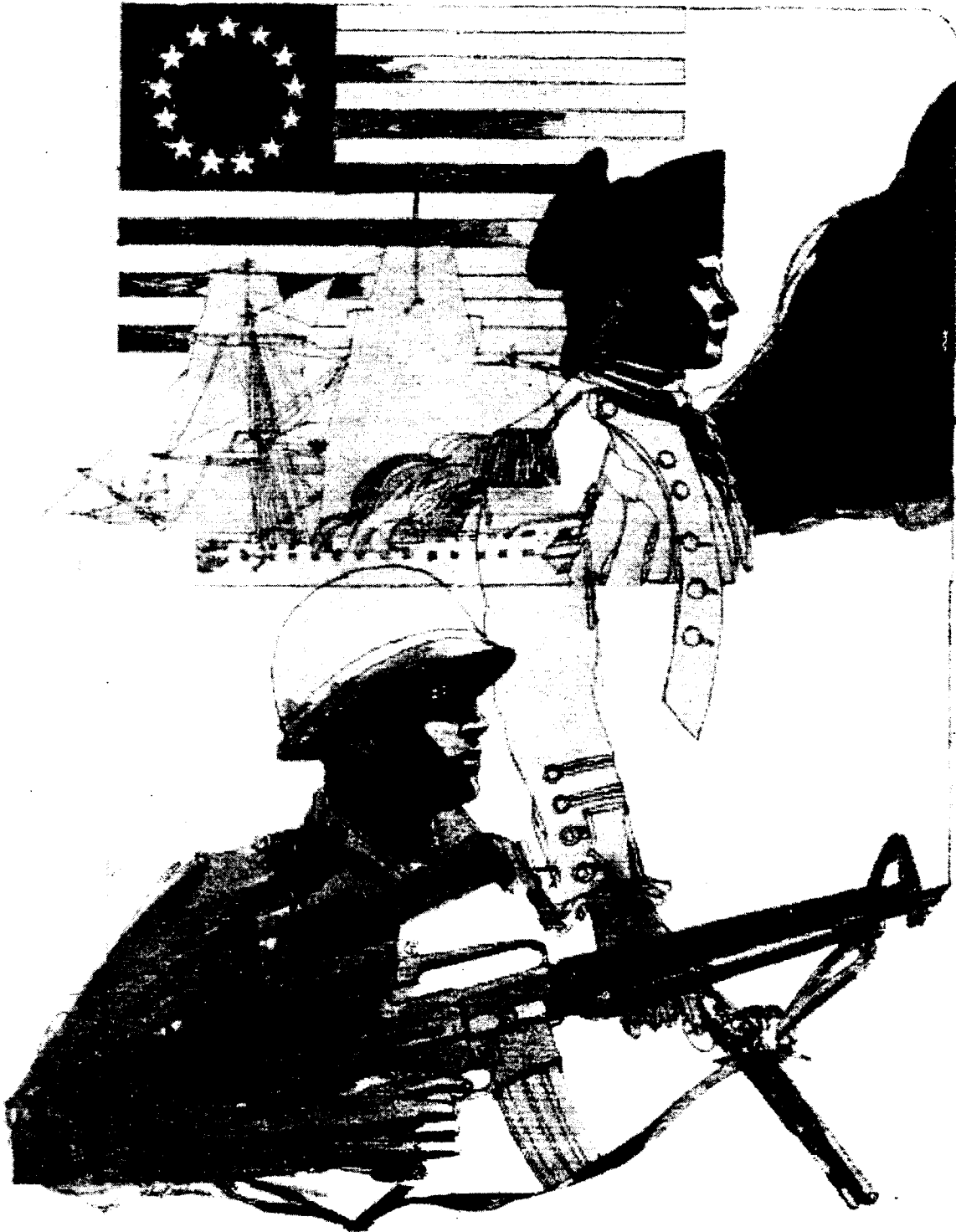
Figure 4. Code of Conduct II