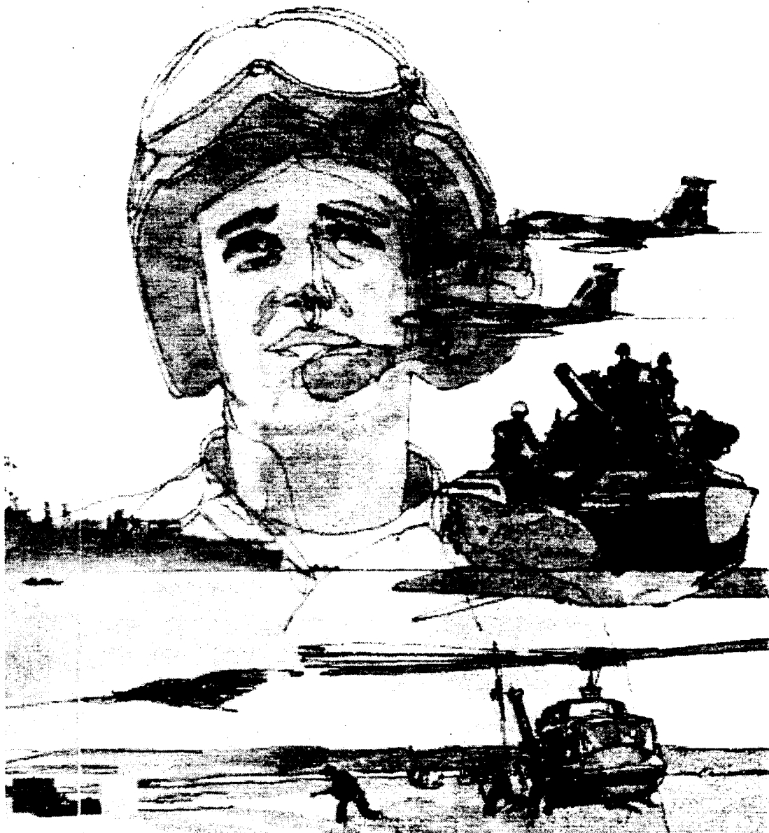
Figure 3. Code of Conduct I—Continued