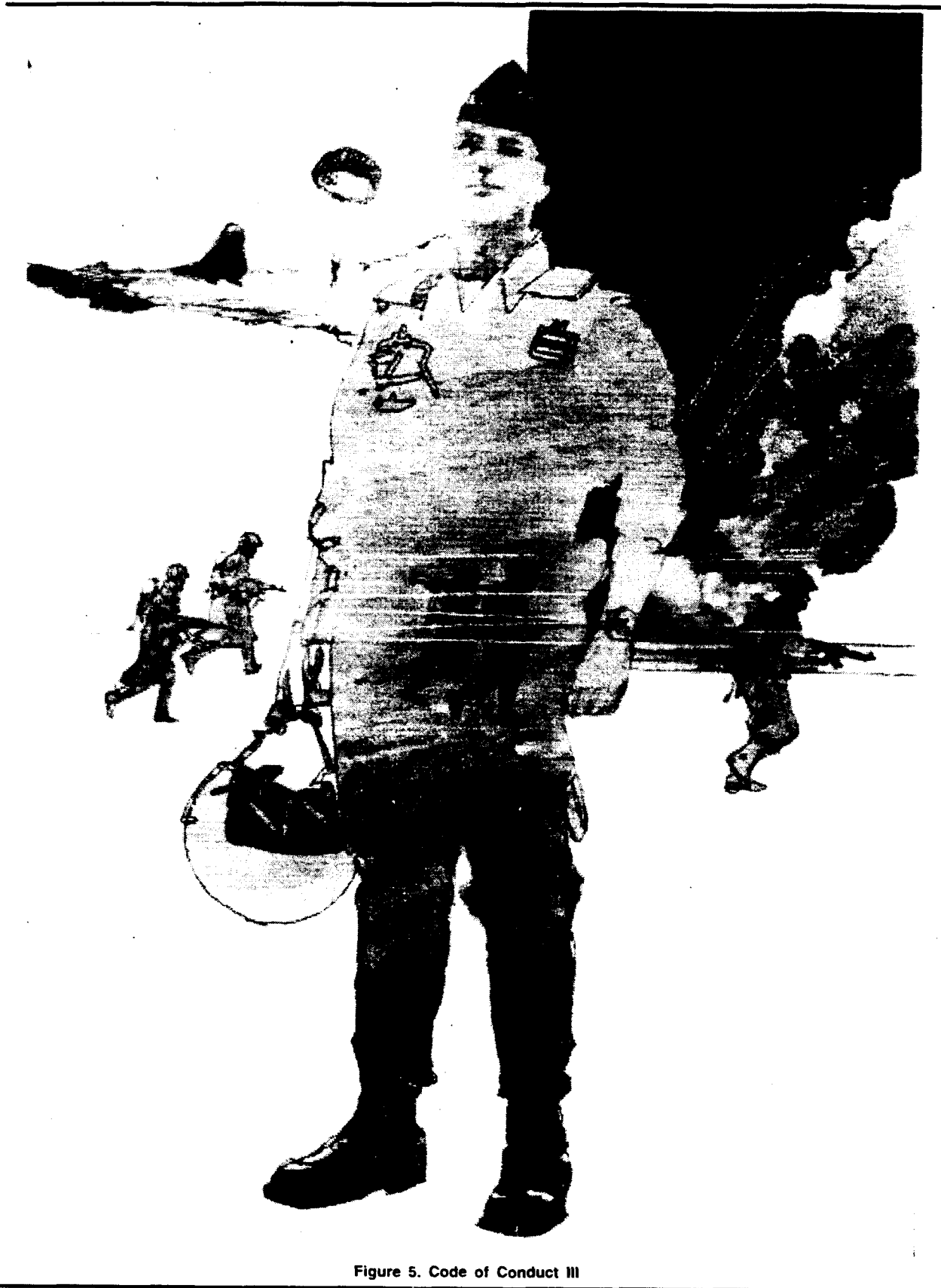
Figure 5. Code of Conduct III