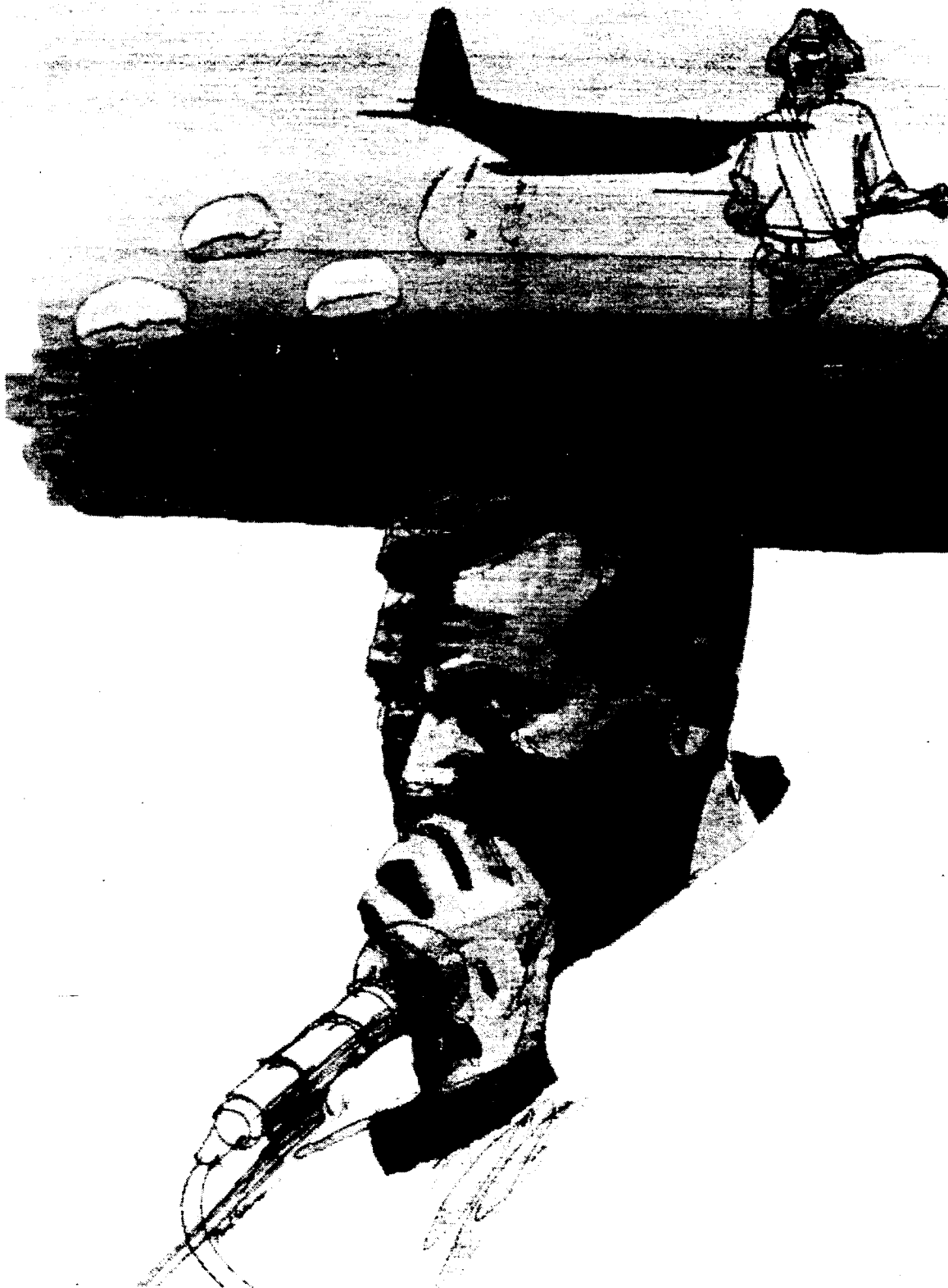
Figure 7. Code of Conduct V