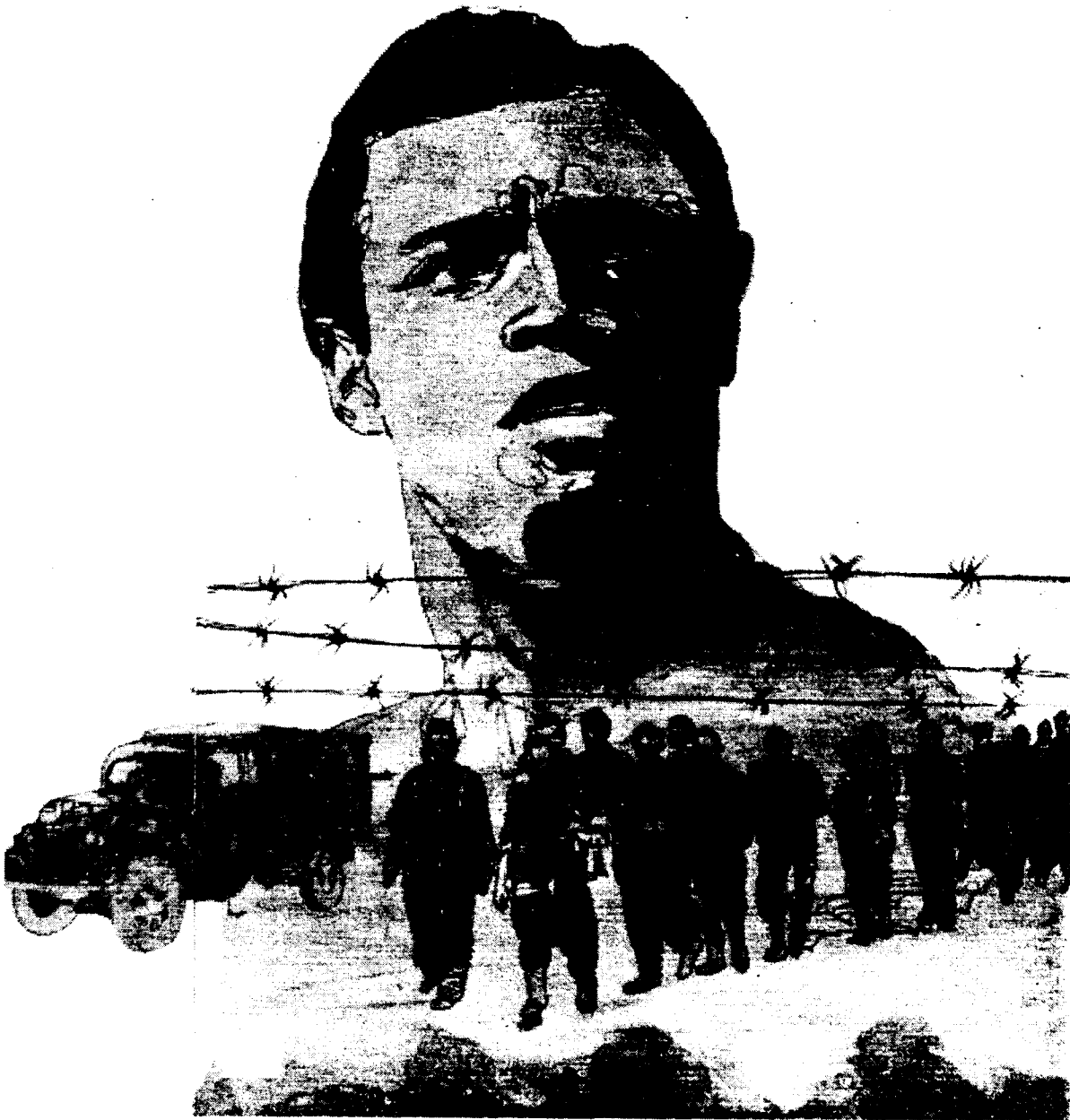
Figure 6. Code of Conduct IV