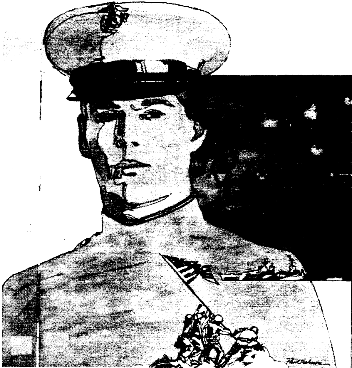
Figure 8. Code of Conduct VI