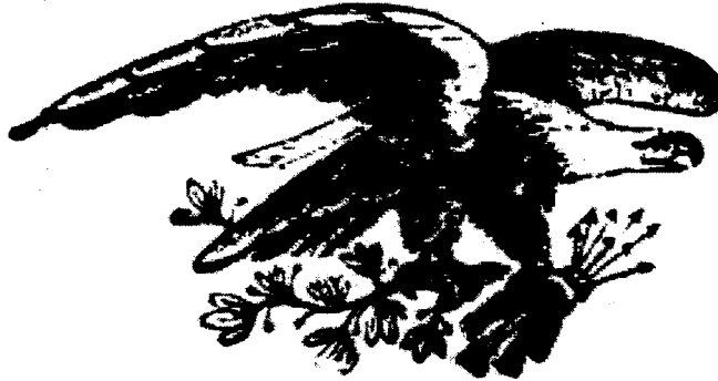
Figure 2. Code of Conduct I

a. I am an American fighting in the forces which guard my country and our way of life. I am prepared to give my life in their defense.