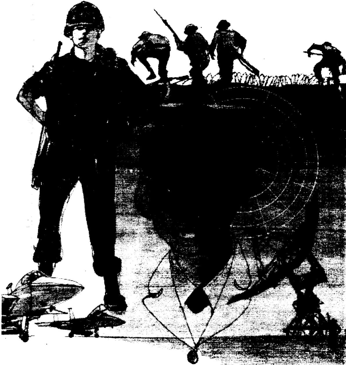
Figure 1. Code of the U.S. Fighting Force