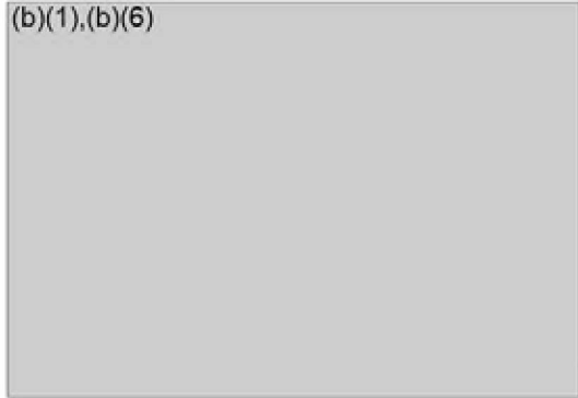
AHMED, ALI ABDULLAH (US9YM- 000693DP)