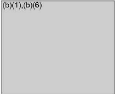
AL UTAYBI, MANI SHAMAN TURKI AL HABARDI (US9SA-000588DP)