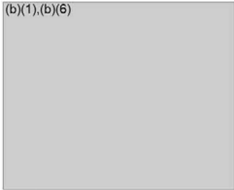
AL ZAHRANI, YASIR TALAL ABDALLAH (US9SA-000093DP)